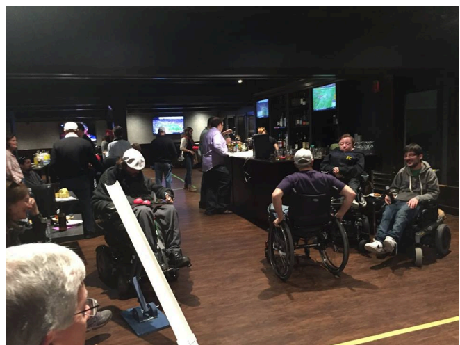
PATH-WAY Bocce Fundraiser Tournament to help support scholarship program.